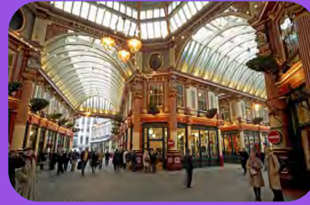
3. Leadenhall Market