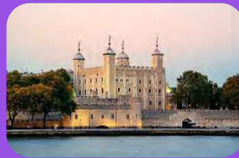
10. Tower of London