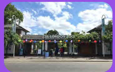
8. ZSL London Zoo