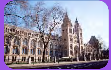
4. Natural History Museum