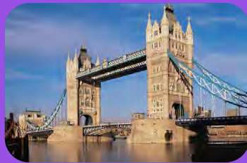
9. Tower Bridge