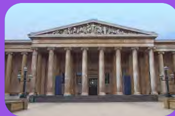
7. The British Museum