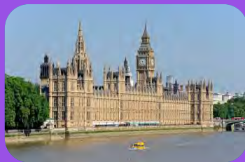
6. Palace of Westminster