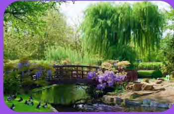
2. The Regent's Park