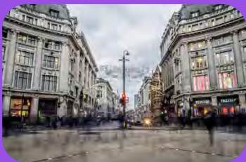
5. Oxford Street