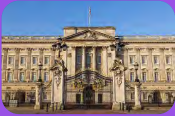
1. Buckingham Palace