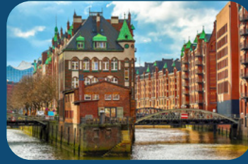
Miniatur Wunderland and the Historic Port of Hamburg