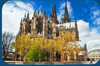
Cologne Cathedral (Kölner Dom)