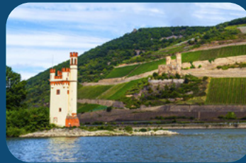
The Rhine Valley