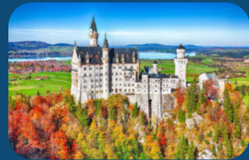
The Ultimate Fairy-Tale Castle Schloss Neuschwanstein, Bavaria