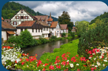
The Black Forest, Baden-Württemberg